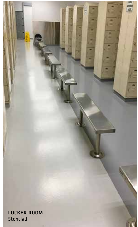
LOCKER ROOM Stonclad

Chemical resistant flooring is designed to stand up to a wide range of harsh chemicals over long periods of time. This type of flooring is one whose functional and aesthetic performance won't degrade with repeated chemical spills or the use of industrial-grade cleaning agents. This allows you to keep important areas 100% sanitary at all times without having to worry about the longevity of your surfaces. They are specifically designed for chemically intensive pharmaceutical environments.