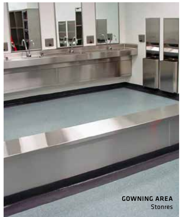
GOWNING AREA Stonres