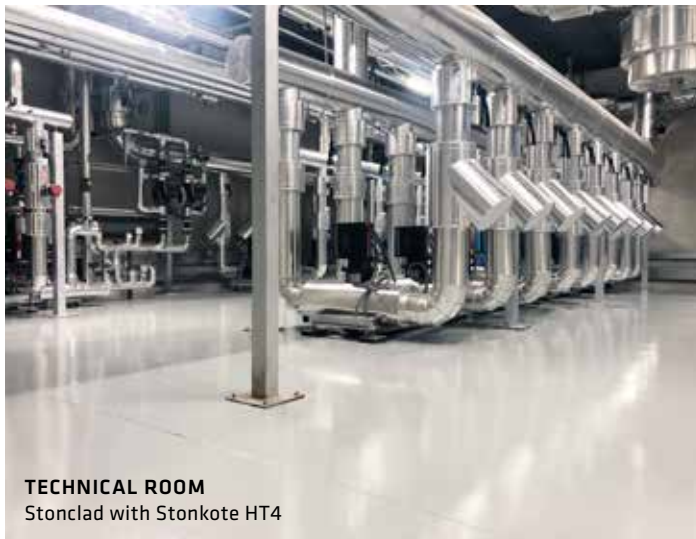
TECHNICAL ROOM Stonclad with Stonkote HT4

Stonhard's broad range of high-performance products and processes are designed to handle the most demanding areas in your pharmaceutical facility and are vetted for the most stringent safety protocols. All our installations are OSHA-compliant so you can maintain peace of mind throughout. Our safety-conscious prep crews work with PPE and HEPA filters, and site safety paperwork is readily accessible to all on-site and off-site personnel to maintain the highest safety standards.