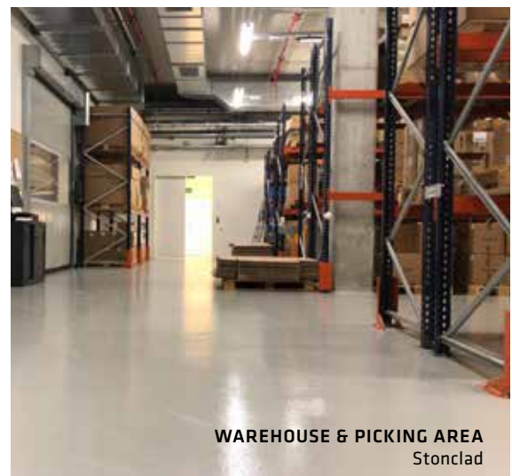
WAREHOUSE & PICKING AREA Stonclad

We understand that pharmaceutical facilities never shut down. That is why we provide quick turnaround on installation, installing our floors when it works for you. This way you can manage your schedule with minimal loss of time and money. From communication to problem solving, Stonhard offers flexibility of service so we can get in and out within your tightest schedules with minimal disruption.