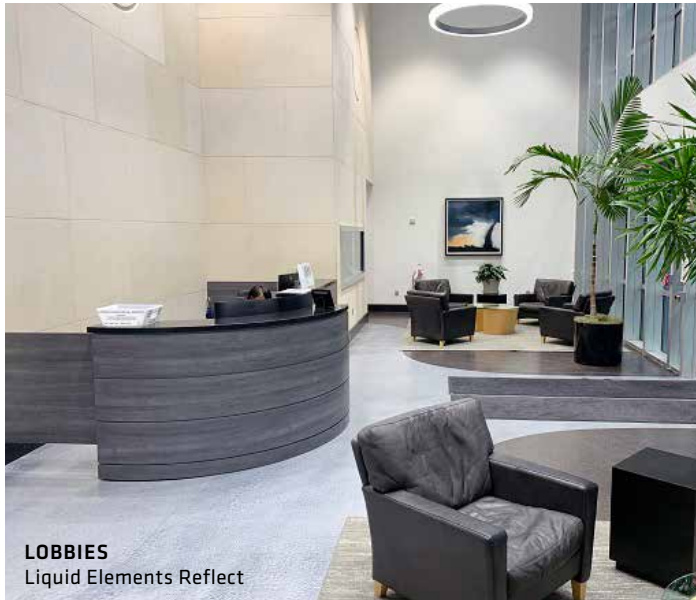
LOBBIES Liquid Elements Reflect